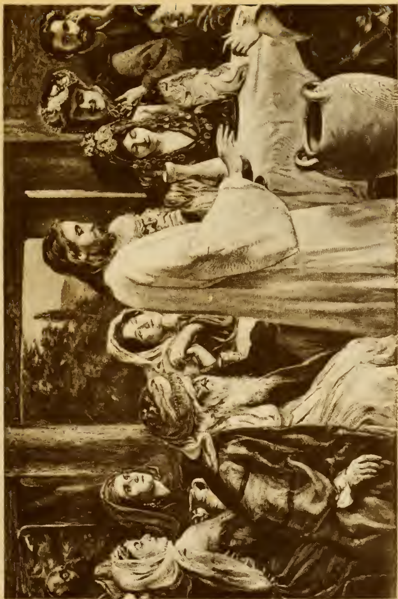
“This beginning of miracles did Jesus in Cana of Galilee. And He manifested His Glory, and His disciples believed in Him.”